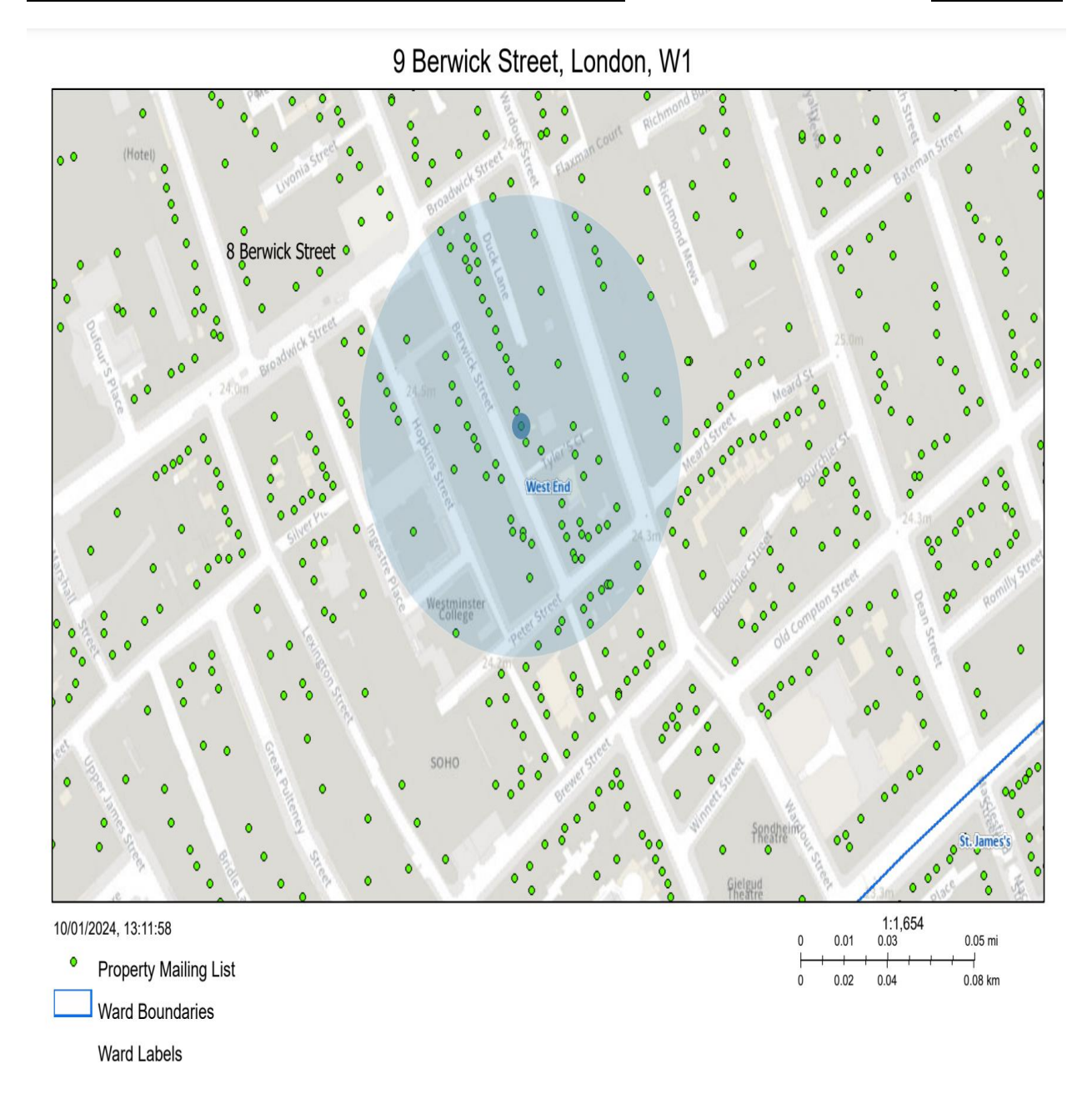
Resident Count: 264